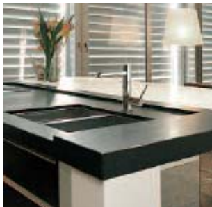
Simplifies kitchen design