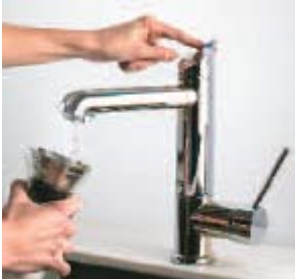
Instant boiling and chilled filtered water

Boiling and chilled filtered drinking water, instantly, PLUS hot, cold or mixed warm water – All from the one tap!