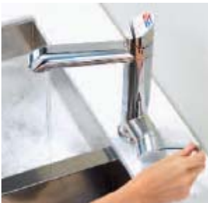
PLUS hot, cold or warm