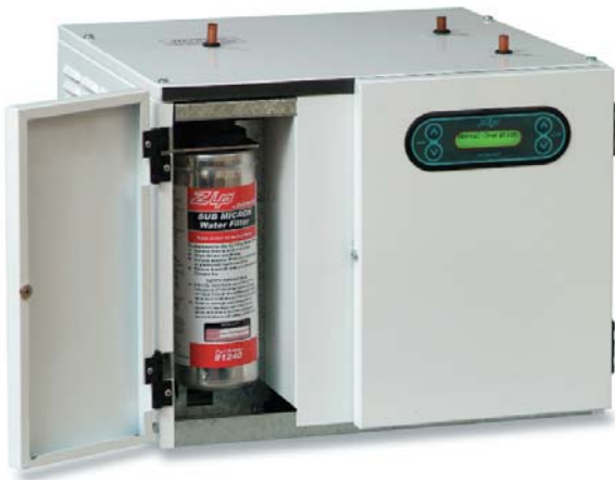
Undersink Unit with filter compartment